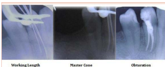
Figure 4: IOPA radiograph of working length, master cone and post obturation of tooth #44.

configuration, while tooth 45 had type I Vertucci's configuration. In the second case, the tooth 44 had type IV Vertucci's configuration. Various challenges can be encountered in the successful management of bayonet shaped roots. One of the main challenges is the shortcoming of periapical radiographs, in which only the curvatures in mesio-distal plane is visible, although curvatures in the bucco-lingual plane are also evident in many teeth [14]. The other challenge is the difficulty in exploration and negotiation of the root canals due to the inability to continuously follow the root canal curvature, which might result in blocking of the canal, ledging, transportation, zipping, perforation, and instrument separation [15].