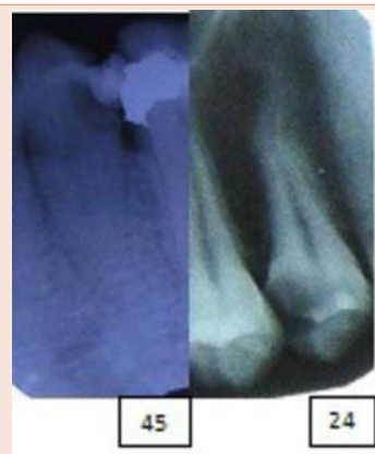
Figure 1: Preoperative IOPA radiograph of teeth #45 and #24.