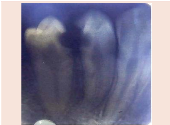
Figure 3: Preoperative IOPA radiograph of teeth #44 and #45.