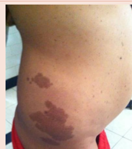
Figure 1: multiple cafe-au-lait spots over the trunk and limbs.

Modified supraglottic laryngectomy, included the resection of epiglottis, aryepiglottic folds and incomplete false vocal folds resection was indicated because the tumor infiltrating the larynx was