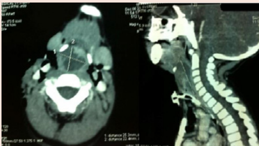
Figure 3: Axial CT with coronal view scan shows a 20 × 30 × 25 mm mass, large hypodense mass slightly less dense than the muscle, obliterating the laryngeal vestibule and invading the larynx.

Up to 1996 there were only 35 cases reported, of which 19 were in pediatric patients [1]. The clinical symptoms of the disease are those usually associated with a slow growing lesion of the larynx: the patient gradually develops hoarseness, globus sensation, dysphagia, inspiratory dyspnea on exertion, sometimes biphasic stridor [2,3]. Some patients complain about dyspnea in the supine position which seems to be associated with the location of the lesion [3,4].