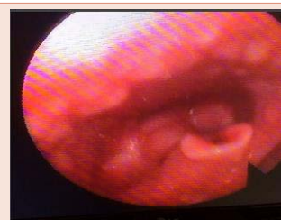
Figure 2: mass at the laryngeal surface of the epiglottis.