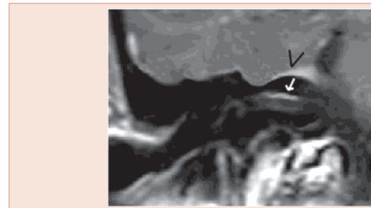
Figure 1: The same patient. Contrast-enhanced coronal T1-weighted magnetic resonance image shows subtle impregnation of the distal labyrinthine facial nerve section (white arrow) along with a linear dural enhancement (arrowheads). These findings were consistent with temporal bone microfracture and dural microlaceration, missed on CT scan.