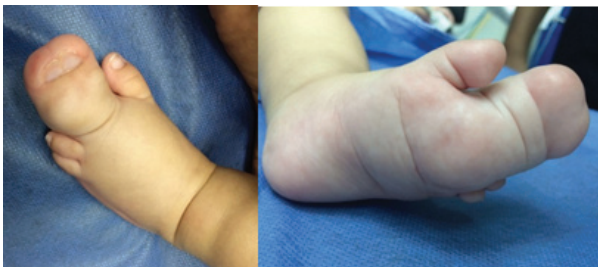
Figure 1: We can see increase of volume and deformity in left foot.

Subsequently, we performed removal of wires from Kirchner