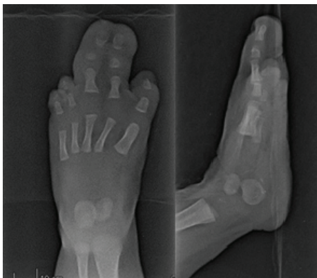
Figure 2: Anteroposterior and Lateral left foot radiograph. Overgrowth of second and third finger phalanges is evident.