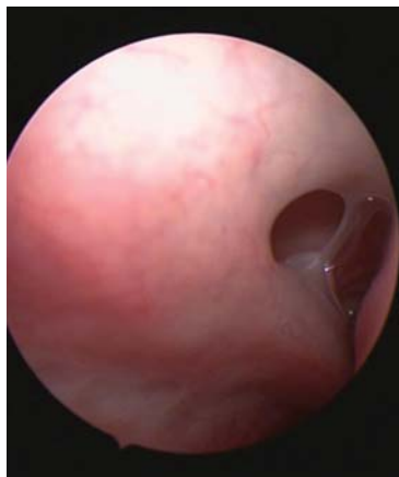
Figure 2: Three-month follow-up of a patient who underwent an “in-office” maxillary BSD procedure and partial anterior ethmoidectomy. 4 mm 120° rigid nasal endoscope showing a left maxillary sinus balloon dilation site from behind the uncinate process looking anteriorly into the infundibular space. This is a difficult endoscopic maneuver and instrument access into the sinus cavity (if needed) is impossible without undue trauma.

As office rhinology evolves and surgeon comfort increases the surgical technique difficulty gap between the MSA and maxillary BSD procedure has closed considerably. Furthermore, “independent” of clinical outcome and efficacy, although the MSA requires some tissue removal it is still minimally invasive with very low morbidity and rapid recovery. Although the MSA surgical technique used in this retrospective study is presented, variations in surgical technique among surgeons would not be a significant factor in the findings observed.