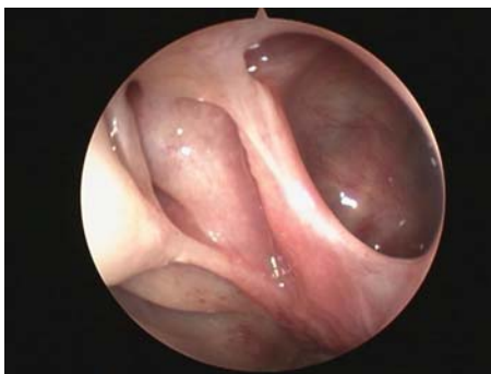
Figure 3: Four-month follow-up of a patient who underwent an “in-office” endoscopic maxillary sinus antrostomy and partial ethmoidectomy. Anterior view - 4 mm 00 rigid nasal endoscope showing the left maxillary antrostomy site with removal of bulla ethmoidalis. Easy endoscopic examination with straightforward instrument access into the sinus cavity if this was needed.

Several distinct potential advantages of the MSA compared to the maxillary BSD procedure revolves around removal of the uncinate. If ethmoid surgery is to be concomitantly performed removal of the uncinate process with the MSA procedure increases surgical visibility and access to the bulla ethmoidalis and anterior ethmoid sinuses.