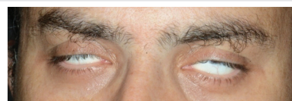
Figure 1: Bilateral Bell's phenomenon during attempted eye closure.

An otherwise healthy 41-year-old male presented to the emergency room with rapidly progressive FD of 2 days