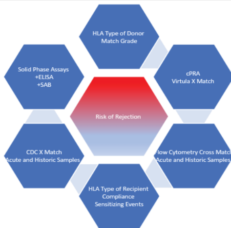
Figure 2: Stepwise approach to immunological risk stratification.