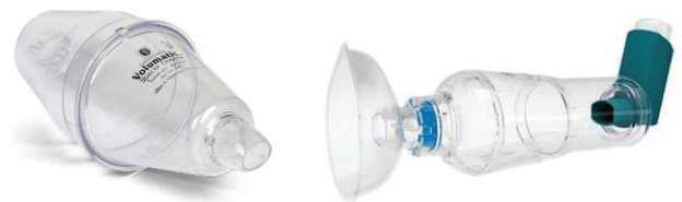
Figure 1: Examples of valved holding chambers inhalers.

One of the most important advantages of the pMDIs is their use in emergency management of asthma, either alone, or in combination with spacer devices [7-9]. Spacer devices were developed to overcome some of the problems of pMDIs. There are two main types: (1) Valved holding chambers (Figure 1), examples include the Volumatic (GlaxoWellcome, Uxbridge, UK) and the Nebuhaler (AstraZeneca, Kings Langley, UK); (2) Extension devices (Figure 2), examples of which are the Optihaler (Philips Respironics, Parisppany, USA) and Aerochamber (Trudell Medical, Ontario, Canada). The valved holding chambers tend to have large volumes of typically 750 ml and allow the patient to breathe tidally from a reservoir of drug. Extension devices provide a space between the inhaler and the patient, allowing the aerosol to slow and the propellants