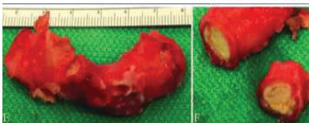
Figure 2E,F: Gross specimen of RA thrombus.