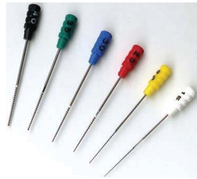
Figure 2: Apical files.