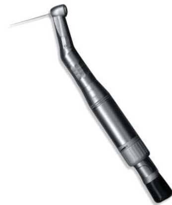
Figure 3: Endo Eze hand piece.

canal. For this, 4 Shaping files S1,Sc,S2,S3 and Endo Eze hand piece is used.