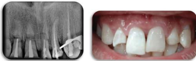
Figure 7,8: X-ray and photo after endodontic therapies.

tooth 13 that had a concussion and has only been under clinical and radiographic control. When pulp involvement is evident, endodontic therapy may be necessary and depending on the type of injury, surgical repositioning and / or stabilization with splints may be necessary [12]. There are several types of splints and the nylon splint (line fishing) is a splint that combines the adhesive technique of composite resin with the use of taut nylon wire 0.6 to 0.7 millimeters in diameter, its has been tested and found to be as flexible as thin stainless steel wire [8,11].