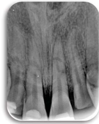
Figure 6: Control radiograph at 15 days.