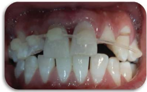
Figure 5: Splinting with nylon first visit.