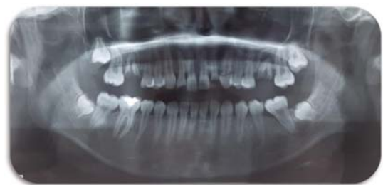
Figure 1: Initial panoramic radiograph.