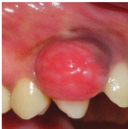
Figure 2: Discrete flattened spherical mass protruding from gingival margin.