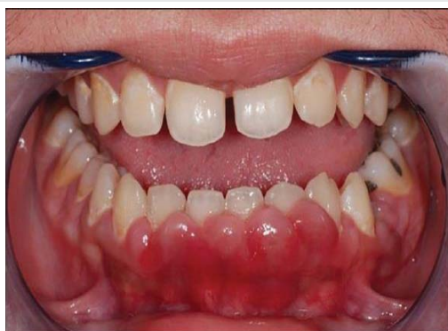
Figure 3: Bulbous enlargement seen in the interproximal area.