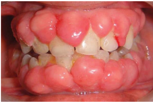
Figure 1: Generalized enlargement of marginal gingiva, attached gingiva and interdental papillae.

over growth (Figure 1), by these agents and even the histologic appearance are reported to have common characteristics such as increase in extra cellular ground substance, number of fibroblast and acanthosis of epithelium.