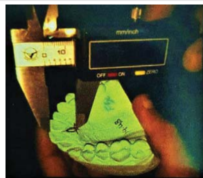
Figure 3: Measuring papilla-incisal distance.