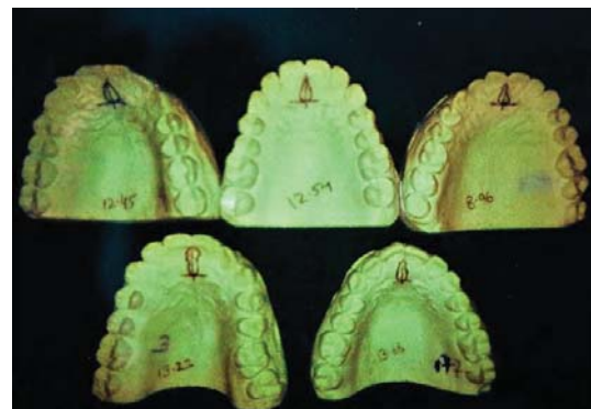
Figure 2: Different shapes of incisive papilla. 2(a)Round 2(b) Flame 2(c) Pear, 2(d) Dumbel 2(e) Cylindrical.