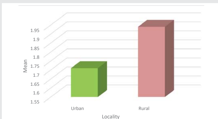
Figure 3: Locality wise comparison of mean DMFT for the study population of 12-year children.

orthodont, one specialist in prosthodontics and 12 general dentists.