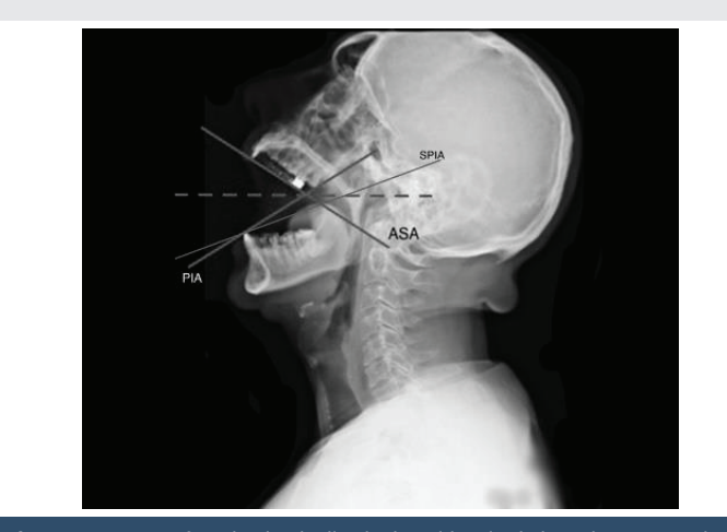
Figure 3: SPIA was found to be the line in the midsagittal plane that crosses in the midpoint two more lines: the RPIA and the Atlanto Superior dental Arch line (ASA) defined as the line joining the superior dental arch and the anterior base of Atlas. We defined the NPL and the PIA as the "hard tissue lines", since they both deal with bone tissue only and NAxL and (i.e. SNPL) and SPIA as "soft tissue lines", due to their relationship with soft tissues as the skin and the soft palate.

Figure 2: de Almeida JR, Zanation AM, Snyderman CH, Carrau RL, Prevedello DM, Gardner PA, Kassam AB. Defining the nasopalatine line: the lowest limit for endonasal surgery from the nasal bones down to the hard palate targeting the odontoid tip.